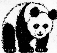
Regd. Trade Mark

Everyone adores them they're so so gay and colourful in a variety of designs :— stripes, spots, checks and tartans. Also self colours in satins, taffetas, failles and petershams. Ask for "Panda" and know you are buying the best.