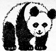
Regd. Trade Mark

Everyone adores them they're so so gay and colourful in a variety of designs: — stripes, spots, checks and tartans. Also self colours in satins, taffetas, failles and petershams. Ask for "Panda" and know you are buying the best.