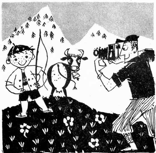
Swiss National Tourist Office, 458, Strand, London, W.C.2