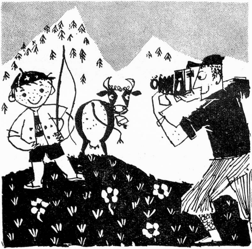
Swiss National Tourist Office, 458, Strand, London, W.C.2