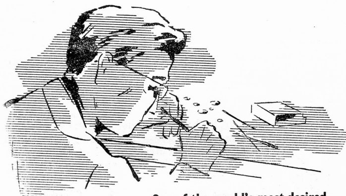
One of the world's most desired watches

The ROAMER watch is one of Switzerland's precision products. In a factory established in 1888 over 1200 highly skilled craftsmen produce and assemble every part that goes into the ROAMER movement.