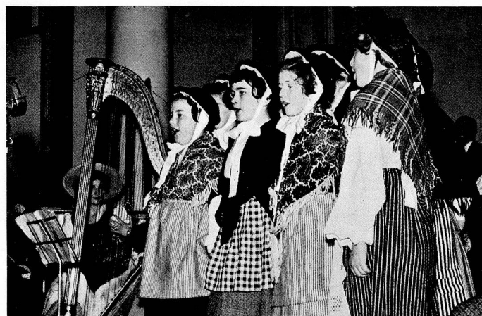
Welsh schoolgirls in ancient costumes give a good sample of excellent choral singing.

The Swiss reciprocated the treat with a film show, giving the audience a true-to-life glimpse of their country's many natural beauties. Later, characteristic presents were exchanged. The Lord Mayor of Cardiff, first citizen of Europe's youngest capital, was given a wooden bear — suitable greeting from Berne, ancient capital city of Switzerland. He, in turn, presented the Swiss Ambassador with a beautifully carved traditional Welsh "loving spoon", an