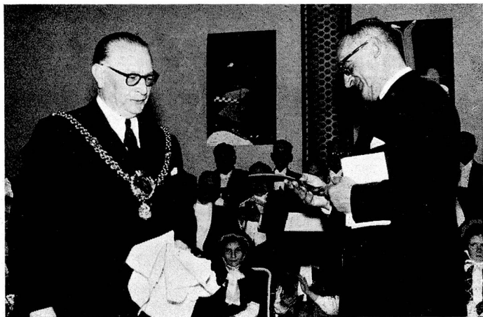
A carved loving spoon is presented to the Swiss Minister by the Lord Mayor of Cardiff.

The evening ended on a note of informal friendliness. Autographs and addresses were exchanged, Welsh hosts and Swiss guests had plenty to chat about. In the background, the gleaming skis stood guard — promising links between Swiss snow and Welsh sand.