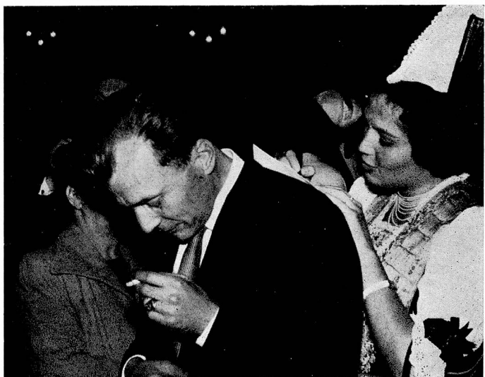
In an atmosphere of informal friendliness autographs and addresses are exchanged.

In his reply, the Swiss Minister expressed the hope that one day Merthyr Mawr will grow into an internationally famous resort.