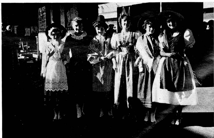
Swiss and Welsh national costumes make a charming picture outside Cardiff station.

A warm reception was given to the delegation at Cardiff station; three young girls in Welsh costume added colour to the scene.