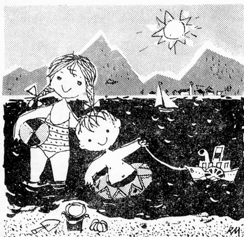
Swiss National Tourist Office, 458, Strand, London, W.C.2

Please let your English friends know that SWITZERLAND OFFERS BEST VALUE FOR MONEY