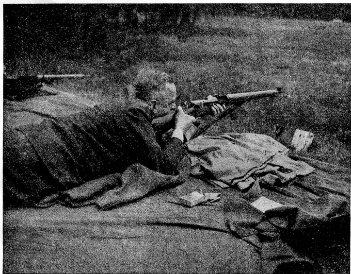
Swiss Ambassador in action.