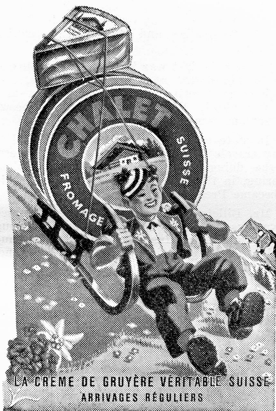
Famous all the World over for Quality and Tradition