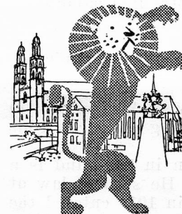
All UK - Switzerland flights are operated in association with BEA