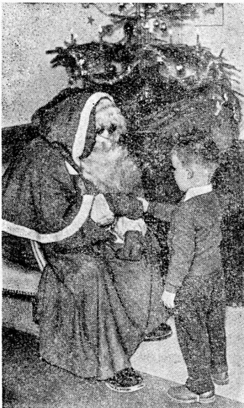
Father Christmas in our Home"

Guests can only be admitted upon application and corresponding confirmation from the "Home".