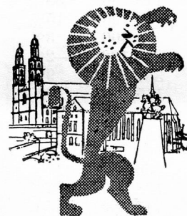
UK — Switzerland flights in association with BEA