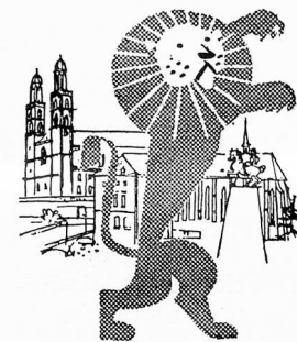
UK — Switzerland flights in association with BEA