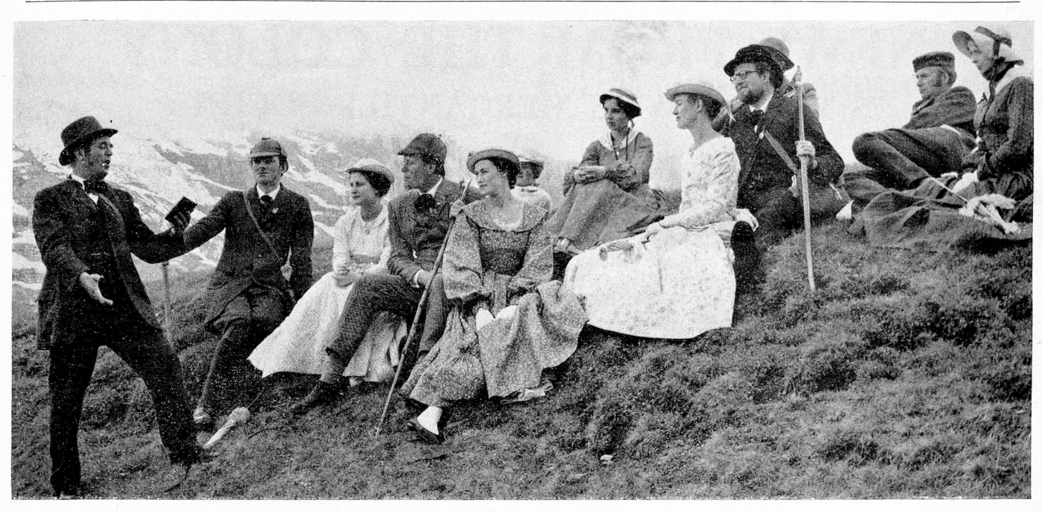
Peaceful scene at Kleine Scheidegg as the travellers rest to listen to the party Paymaster quoting Byron.