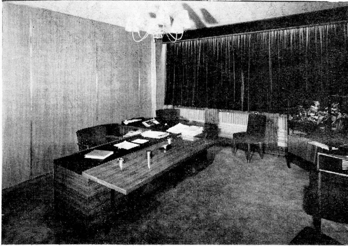
The Managing Director's Office.