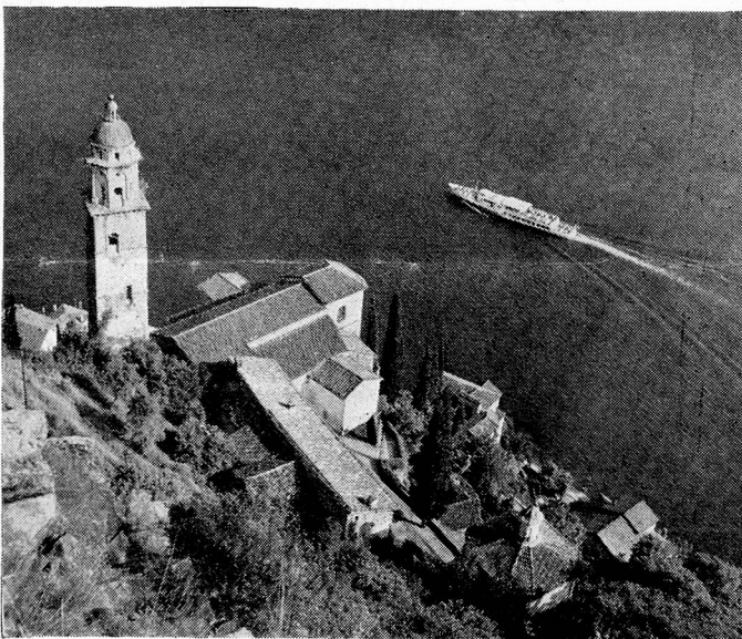
CORALE UNIONE TICINESE

In the true tradition of the Fête Suisse, local talent is included. Who better than the CORALE OF THE UNIONE TICINESE would qualify? For a good number of years this group of singers has entertained the Colony on many occasions. The CORALE, too, has gone through a crisis, but just recently its numbers have been increased considerably and the choir in its picturesque costumes will appear in new strength at the Fête Suisse. I understand its repertoire has been added to by some more attractive tunes from the Ticino and we can be sure of spending a happy twenty minutes listening to songs reminding us of the beauties of Southern Switzerland like this picture showing the Lake of Lugano with the famous church of Morcote.