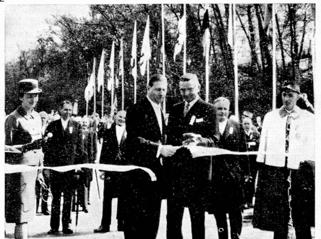
The president of the Swiss Confederation, Mr. Ludwig von Moos, is opening officially the EXPO 1964 in Lausanne Eröffnung der EXPO 1964 in Lausanne