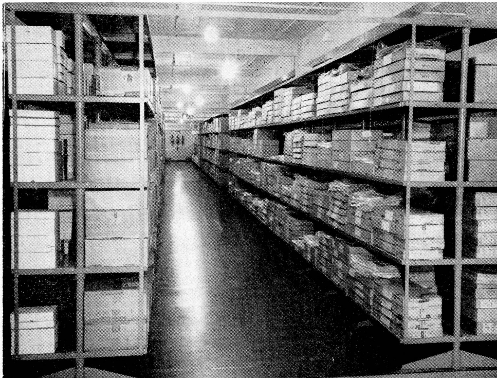
The illustration shows Acrow Cantilever Shelving installed in the Guildford branch stockroom of Marks & Spencer Ltd.

M·A·T TRANSPORT A.G., Sihlfeldstrasse 88. 8036 Zurich PHONE : 258992/95 TELEX : ZURICH 52458 - MATTRANS