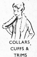
COLLARS, CUFFS & TRIMS

"Velcro" touch and close fastener (a Swiss inven- tion) is made of two Bri- nylon strips which grip firmly at a touch, yet easily peel apart. "Velcro" can be cut with scissors to any length. You can sew it on by hand or machine. It can be washed and dry-cleaned. Can- not jam or rust.