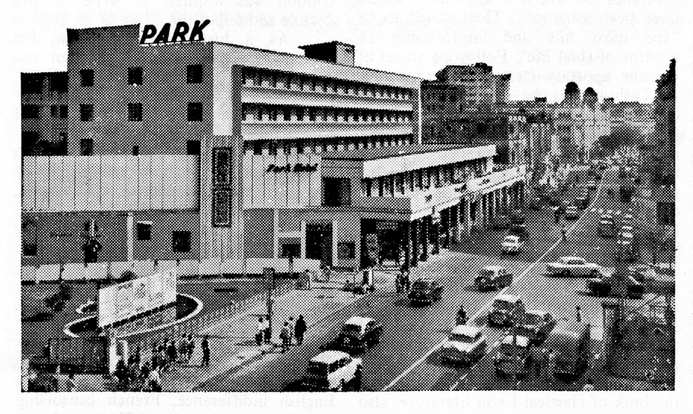
Street in Calcutta

The largest patisserie we have seen in India, a place called Wenger at Connaught Circus, in the centre of Dehli, might well have been of Swiss origin judging from the name and some of the continental cakes on sale. Owing to the presence of a large crowd of buyers, it was not possible to get confirmation from the Manager.