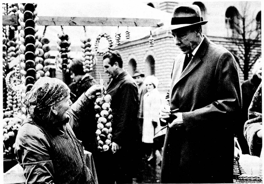
Federal Councillor Tschudi shopping in the market

The 300 years of dominating extensive territories were only possible because