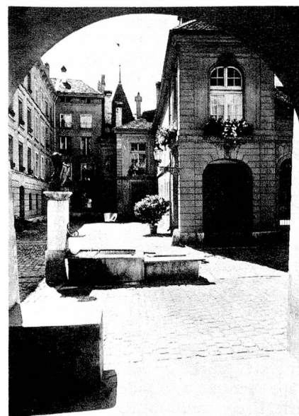
Berne à la française

of a stern yet circumspect government. This was limited to a few dozen "regimentsfähige" families. This patrician rule also had its good sides. The administration was considered exemplary, and the subjected territories were only too ready to keep to the old order even after "liberation". The rural population was treated with respect by the town.