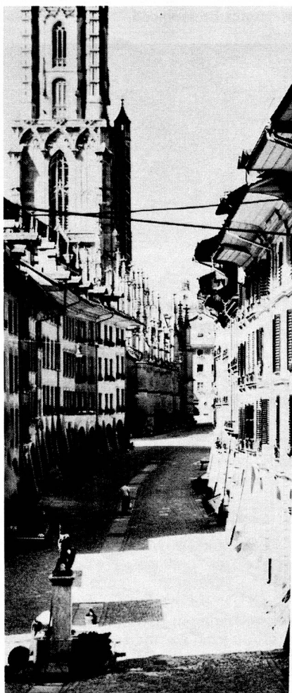
The Junkerngasse, one of Berne's old streets