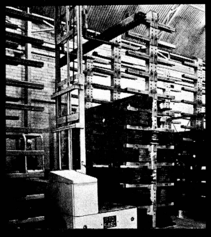
Series 449: Cradle rack storage system (for section storage)