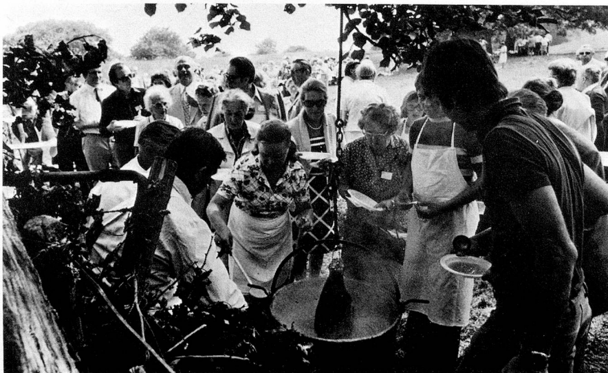
On with the peasoup!