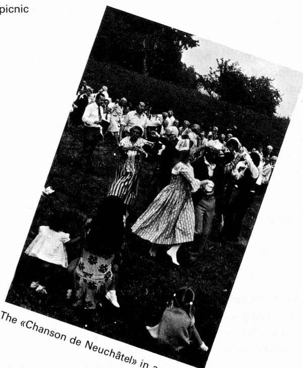
The «Chanson de Neuchâtel» in action