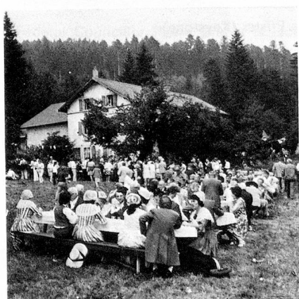
During the picnic