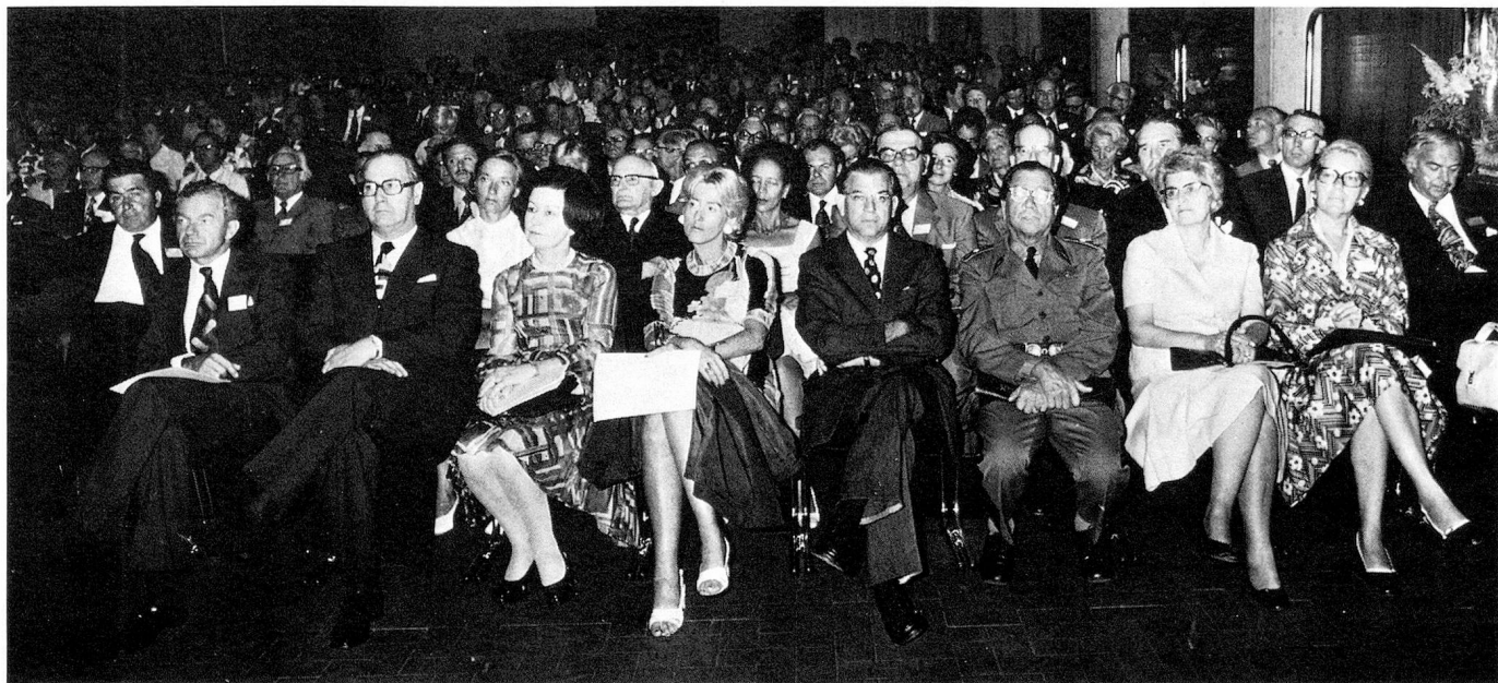
Front row: from right to left