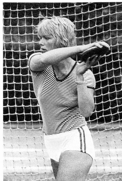
Rita Pfister (Keystone)

A rock face of several tons collapsed onto the Gotthard railway line between Faido and Lavorgno (Ticino). Fortunately, there were no victims.