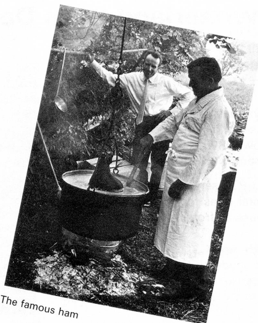
The famous ham