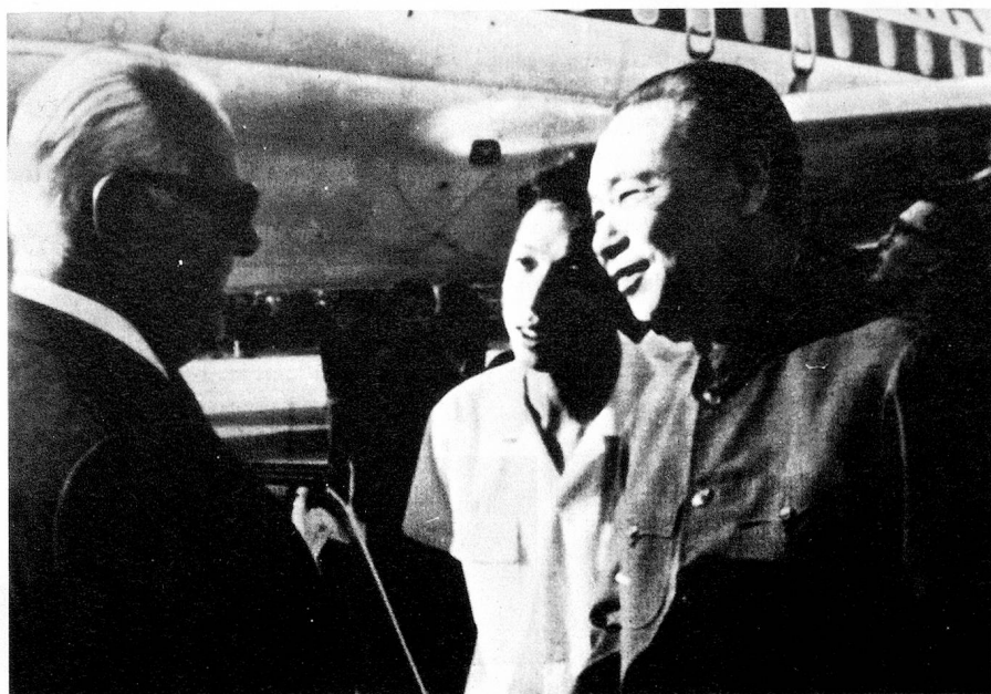
Federal Councillor Pierre Graber is received in Peking by his colleague Tshi Peng Fei

schoolboy enabled archeologists to establish that 400 000 years ago, prehistoric beings lived in Switzerland.