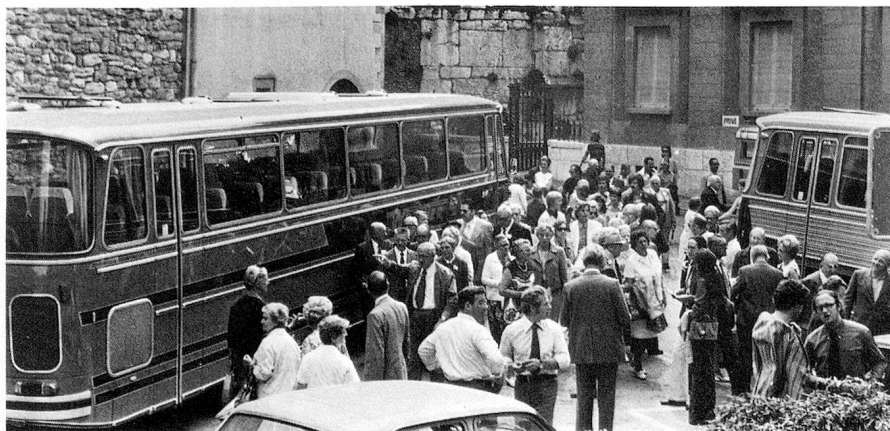
Sightseeing in Neuchâtel