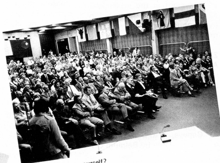
Can you recognise yourself?