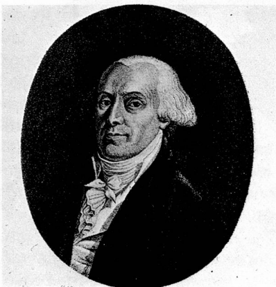
Mr Louis d'Affry, Landammann