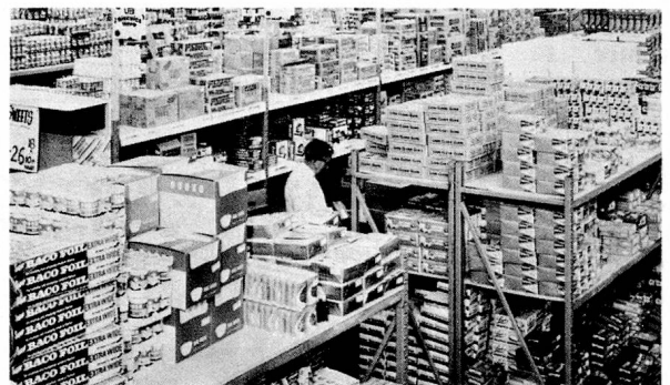
Series 70 MEDIUM DUTY 8,000 lbs. PER FRAME Racking for non-palletised merchandise. Clear spans up to 8 ft.

Acrowracks can be installed or adjusted to suit changing requirements quickly and at low cost. Find out more about them, telephone your nearest Acrow Branch Office today.