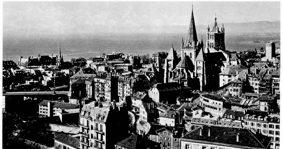
Lausanne, scene of Chessex's novel "l'Ogre".