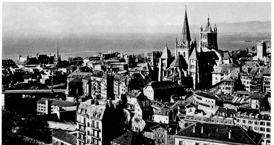
Lausanne, scene of Chessex's novel "l'Ogre".