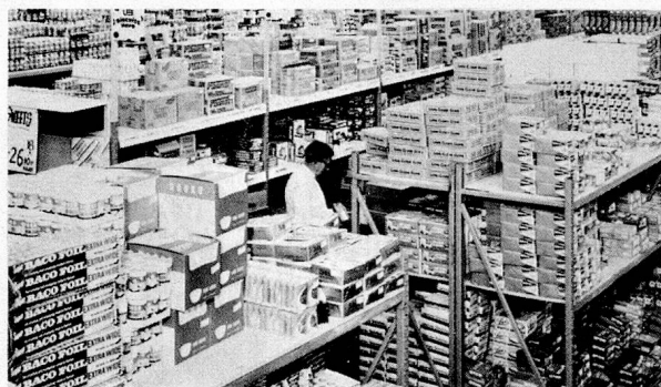
Series 70 MEDIUM DUTY 8,000 lbs. PER FRAME Racking for non-palletised merchandise. Clear spans up to 8 ft.

Acrowracks can be installed or adjusted to suit changing requirements quickly and at low cost. Find out more about them, telephone your nearest Acrow Branch Office today.