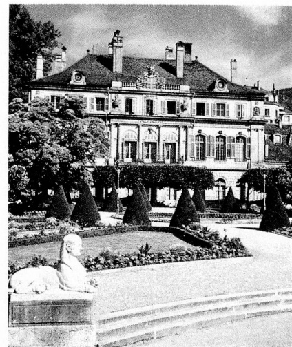
The Peyrou Hotel and its French park at Neuchâtel.

The town of the Lowlands, Neuchâtel, is more imposing. After all,