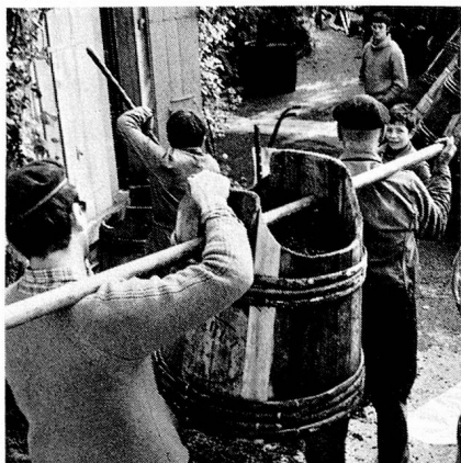
The grapes have left the vines. Now begins the great alchemy in the barrel.