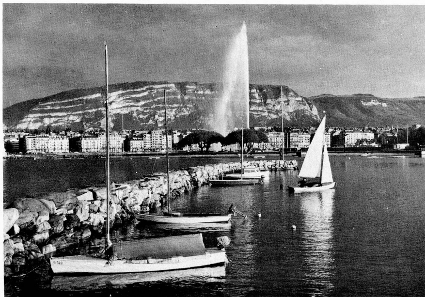
Geneva waterspout and the Salève hill in the background.

Since then, the Commune, relying on this charter, has consolidated and expanded all the time and that