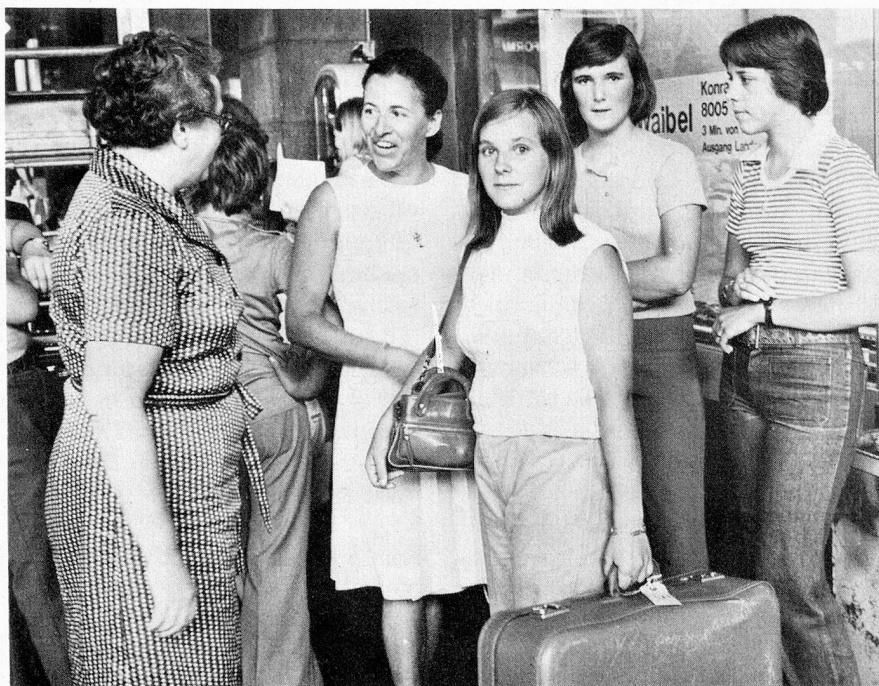
The meeting