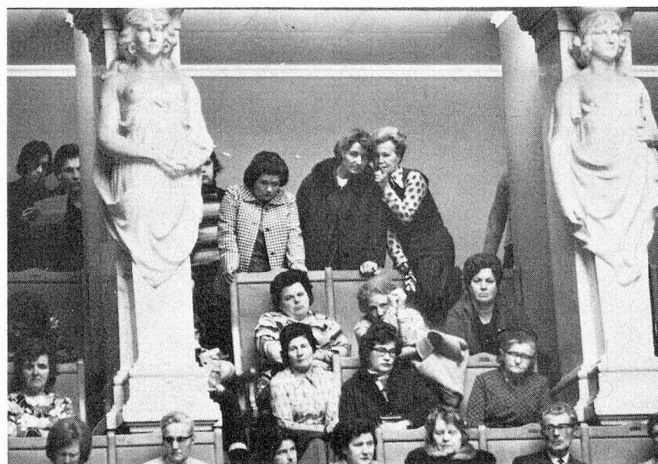
Listeners at the National Council.

special diploma schools which prepare pupils for social work, educational and nursing jobs; so far these have been frequented almost exclusively by girls.