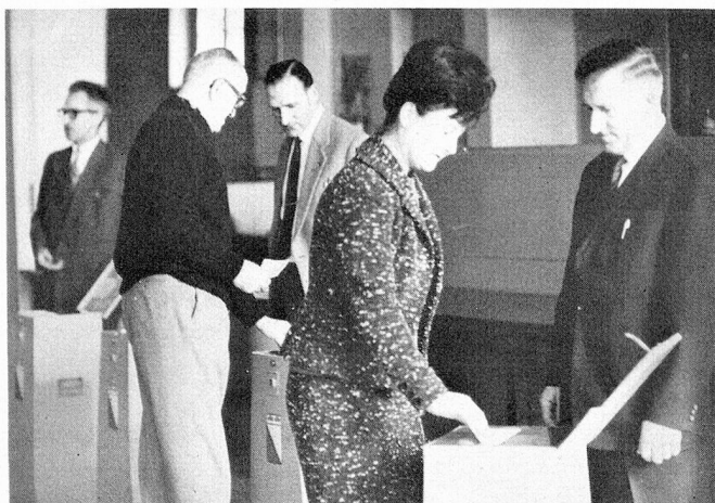
In the voting local (Keystone).