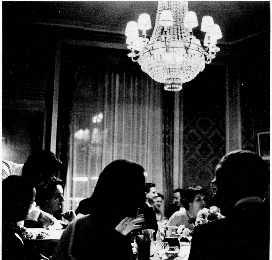
Gala Dinner at the Hotel des Bergues, Geneva

perpetuation of this "money-making" myth. The conspicuous opulence of the leisured classes who frequented the resorts of St. Moritz, Davos, Gstaad and Lausanne, their financial dispositions and indolent life-styles were such that their contribution to the maintenance of the hotel industry as a profitable enterprise could be equated to their willing ability to be separated from their money. Nonetheless, this clientele hindered the real vocation of the hotel industry. It prevented it from developing anything