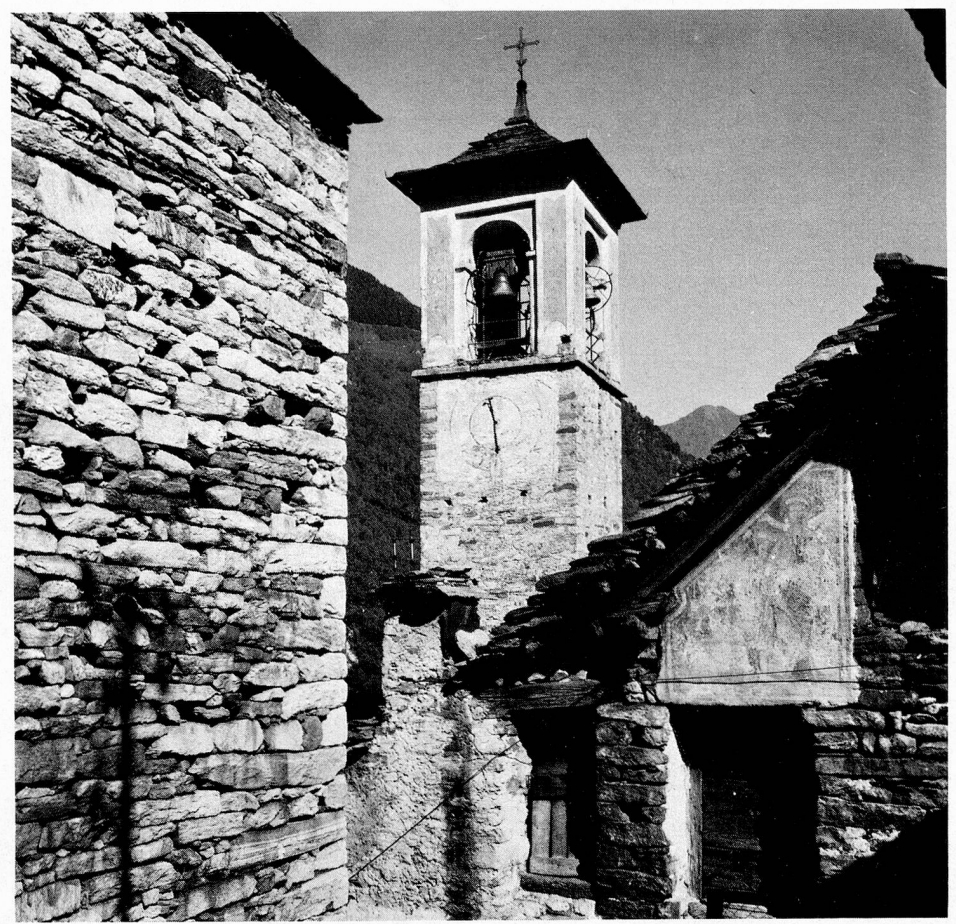
The village church in Corippo in the Verzasca valley, Ticino, dates from 1794.

Corippo is still a unified community. The biggest problem is how to make the old, crumbling houses habitable.