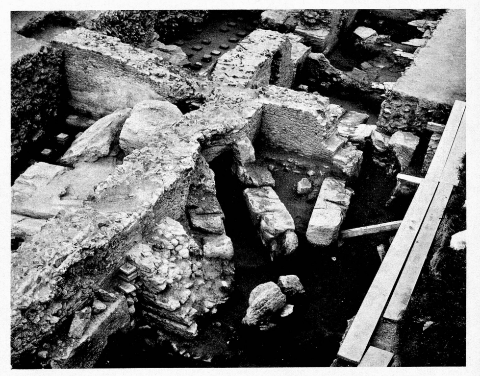
This important but partly unexplored Roman settlement is Octodurus near Martigny, Lower Valais.

the Valeria Museum at Sion. Only fragmentarily excavated, the remains are in a bad structural state although they are of national importance as a document of cultural history. But the urgent requirement for Octodurus is access to this irreplaceable heritage. It is not simply a question of safeguarding and restoring the excavated remains and of stimulating continuous and systematic research and excavation; far more difficult are the planning questions and the problems of legally protecting the site.