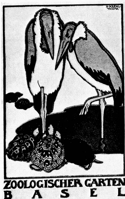
ZOOLOGISCHER GARTEN B A S E L

replaced by trenches or moats. In an attempt to reconstruct the original habitat, zebras, ostriches and gnus were brought together in enclosures that copied the African steppe, while nilgais, reduncas and bantengs were placed in a landscape modelled on the Indian savannah.