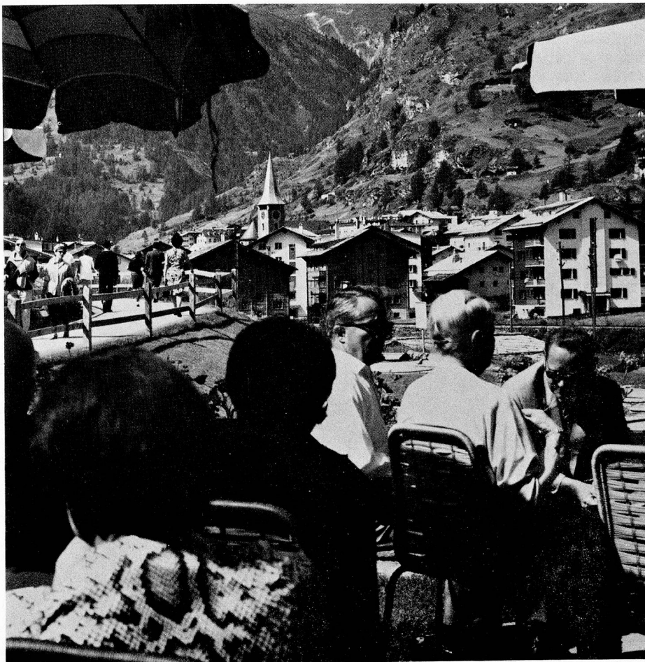
Zermatt is beautiful as this picture shows. All praise to those who are fighting to keep it that way.

It has been reported that, on at least one occasion, there were more than 100 climbers on the mountain at the same time.