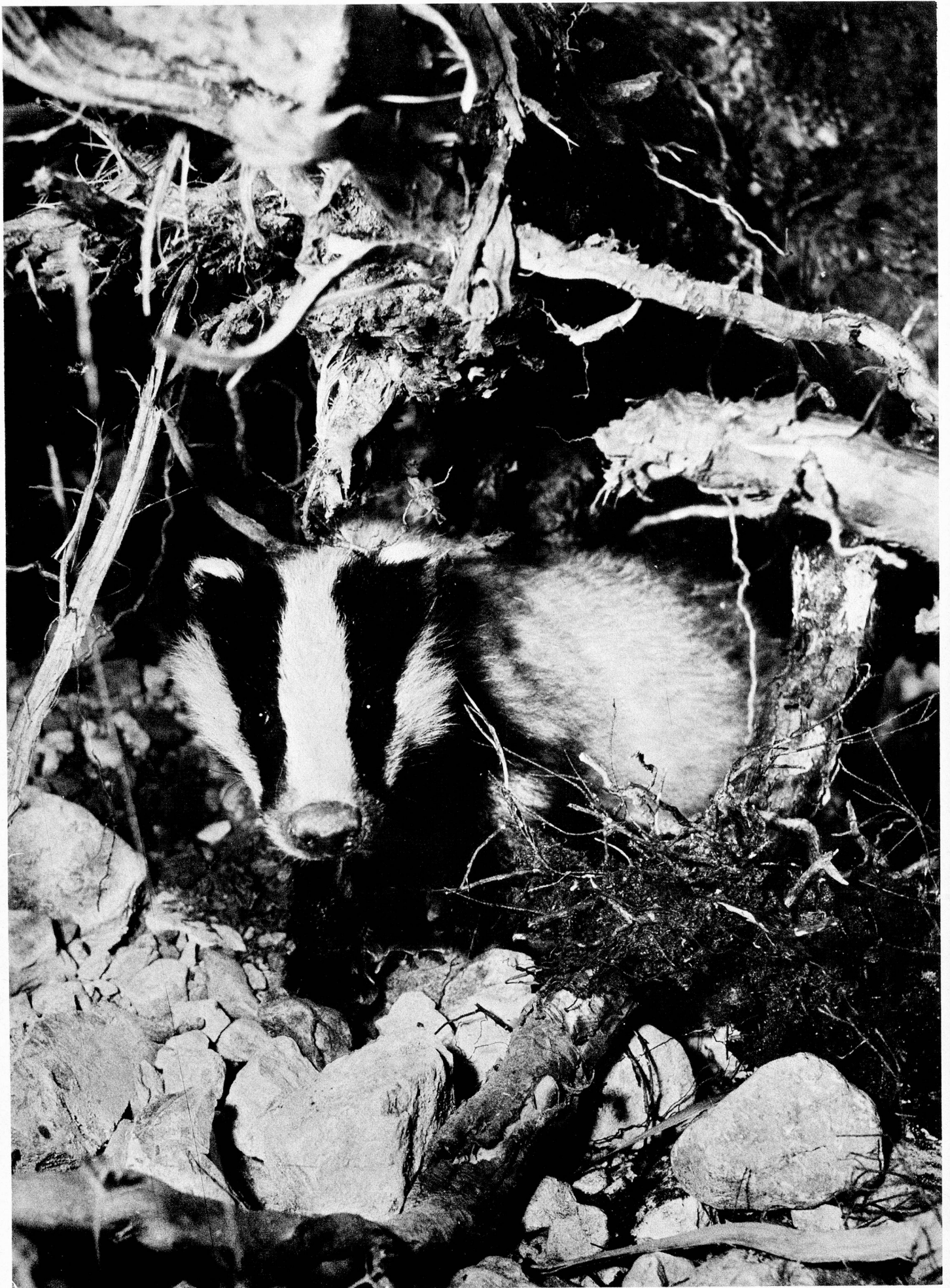
The badger is a nocturnal creature so great patience and skill must have been needed to obtain this photograph. This creature also deserves our recognition in the context of overall respect for our ecology.