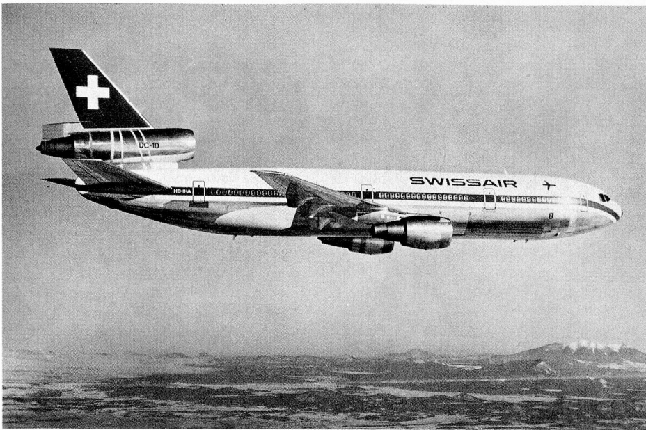
This DC10-30 wide-bodied jet is one of the latest additions to Swissair's fleet. With the advent of these giants of the air Swissair has sold two of its DC8s — see story right.