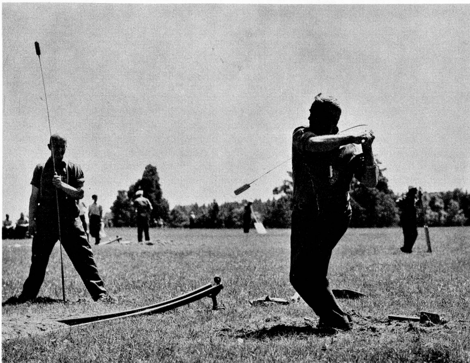
Hornussen is recognized in Switzerland as a national game. Here the Hornuss is sent down the field using a long willow-handled mallet.

Travellers from the Grimsel Pass to Meiringen (or vice-versa) should make a point of calling at the new rock crystal museum in the holiday village of Guttannen. There, crystal hunter and mountain guide Ernst Rufibach has put his fine collection, formed over 20 years, on view to the public. In the 38 glass cabinets can be seen rock crystals, smoky quartzes, pink fluorites and various other minerals.