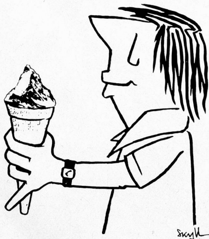
«Swiss ice cream»