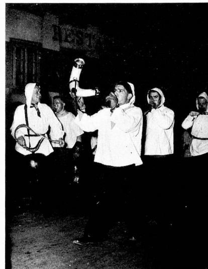
«Klausjagen», an old St. Nicholas custom in Küssnacht

In 1493, a son was born to a German doctor and a native woman of Schwyz near Einsiedeln, Theophrastus Bombast (Baumast) von Hohenheim, better known by his second name Paracelsus . After the death of his mother, the young man started out early on study travels through many countries. In the valley forest he had got to know and recognize the power of medicinal plants; and now he made himself conversant with the