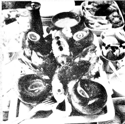
Hors d'oeuvre in First Class.