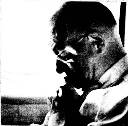
Three hours more to get ready for the meeting.