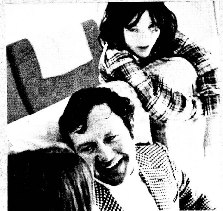
Leg and elbow room.