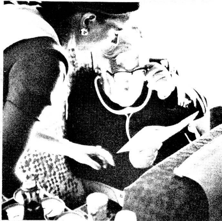
You can be choosy over your Supersuiço brunch.