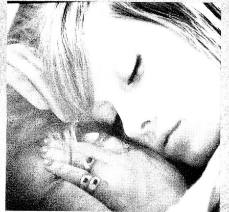
Dreaming of São Paulo.