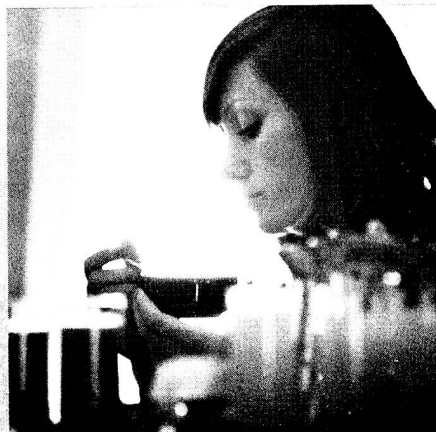
Good morning, Rio.

Swissair flies a modern, spacious, and comfortable DC-10 once a week, a DC-8 twice a week to Rio, Sao Paulo, Buenos Aires, and Santiago. It costs no more. The connections from London are good — and you can travel in style. Isn't that wonderful?