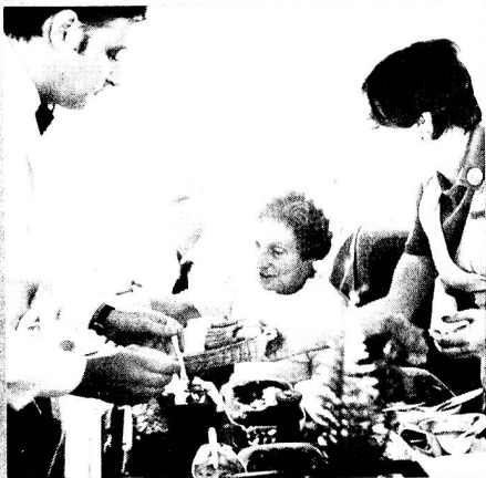
Service leaving nothing to be desired.