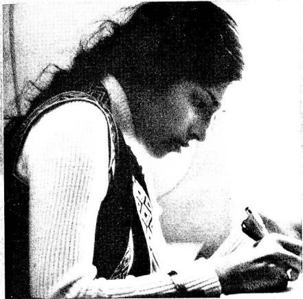
Best wishes from Swissairland.