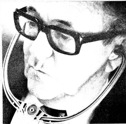
Eight musical programmes from beat to Beethoven.