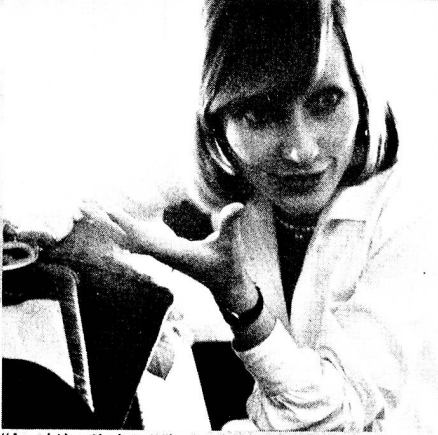
"And that's just the reason why I booked Supersuiço."