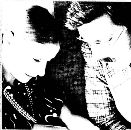
9 down: River in Argentina.