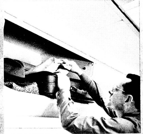
Luggage in the compartments is always ready to hand. But never in the way.