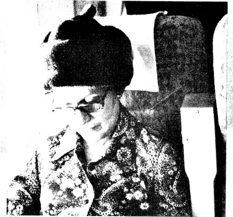
The non-smokers like to keep to themselves.