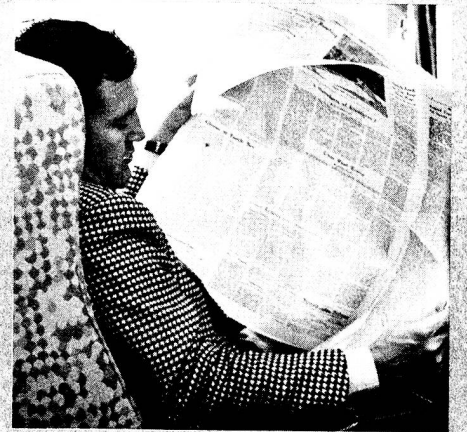
All the comforts of home.