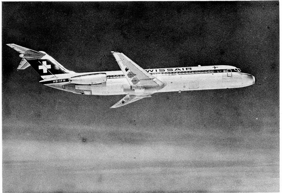
A Swissair DC-9-32 similar to that which is being sold to Texas International Airlines.

In the Swiss balance of revenues for 1975, Swiss tourism thus once again comes third for net receipts, after revenue from capital (5.15 billion) and "other services" (2.95 billion) — a heading that covers licence fees, the expenditure of international organizations, bank commissions, etc. On the European level, her gross tourist receipts of 5.38 billion francs place Switzerland in 7th position.