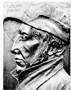
Hunter's head

As poet and narrator he writes above all in his mother tongue, the Ladin of the Engadine (poems, stories, essays, one-act plays, radio plays). More and more, he also writes in German, specially prose and dramatic works, as well as journalistic commentaries which appear in dailies and periodicals at home and abroad. Some of his publications in German are «Sgrafits» (poetry in Romansh and German 1959), Tales (Gute Schriften Zurich 1968), «Arosa» (text for a picture book, RA-Publishers Rapperswil 1972), «That afternoon at Poschiavo» (tales, Reinhardt Basel 1974), «Active Service» 1939-1945 (documentary Ringier Zurich 1975).