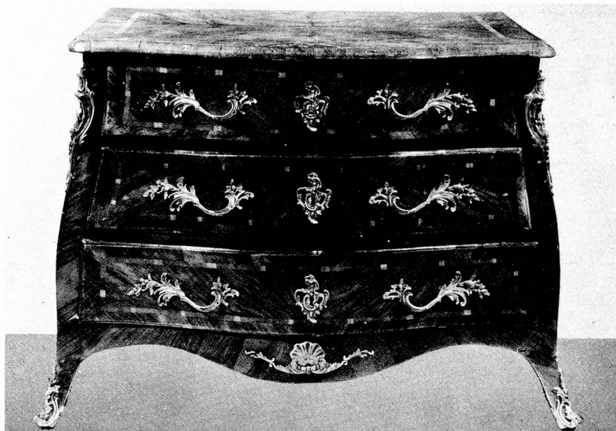
Chest of drawers, Louis XV, Berne.