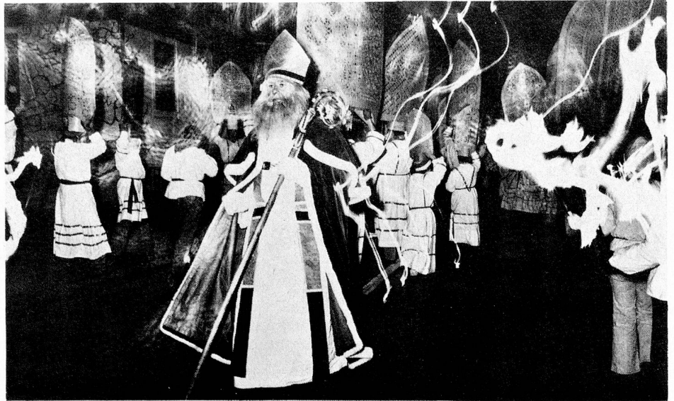
In Küssnacht near the Rigi, St. Nicholas is escorted through the town by acolytes wearing illuminated mitre head-dresses.

Swiss children do not have to watch the calendar to anticipate the coming of Christmas. They have their first taste of the celebrations to come as early as 6th December, on St. Nicholas' Day, a special day for children. Father Christmas, resplendent in crimson robe and flowing white beard, strides through the streets accompanied by "Schmutzli", his faithful servant, whose coal-black face, sometimes frowning, is more often laughing and smiling as he hands out to the children his "Grättimaa". Also called "Grittibänz" and other names, it is a comical, decorated bread figure which is always associated with him.