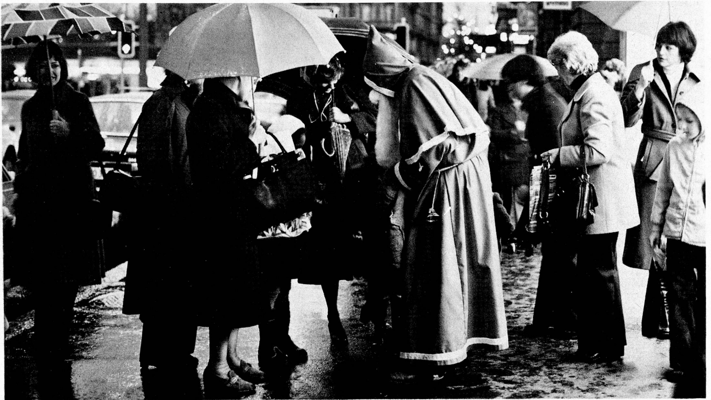
On 6th December, St. Nicholas meets people in the streets and hands out goodies to young and old.

In the towns the coming Christmas is heralded especially by a blaze of decorative lights. Streets, house fronts with fir branches and illuminated Christmas trees begin to sparkle as the evenings draw in, and the brightly lit and decorated shop windows draw the crowds.