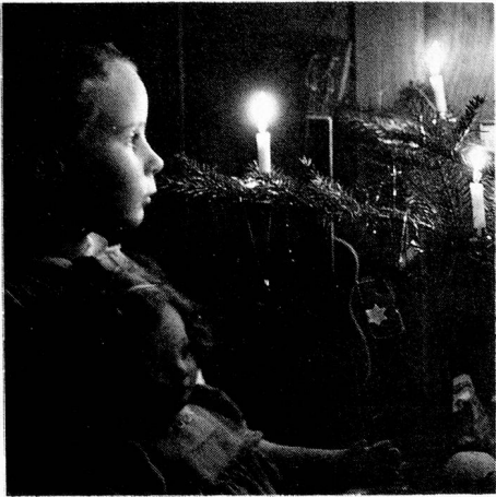
December 24th, Christmas Eve and all is ready. The family, especially the younger members, gather expectantly round the Christmas tree.