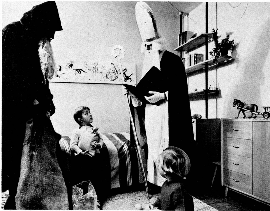
On 6th December St. Nicholas and his servant Schmutzli visit the smaller children. A few are gently admonished, most are praised. All receive something nice.

One Zürich Christmas tradition holds the children spellbound – the “Märlitram”, an old-time electric tram, brightly lit, decorated and sparkling like Cinderella’s magic coach. It passes slowly through the streets – and is driven by St. Nicholas himself, while the children listen to fairy stories told by an angel.