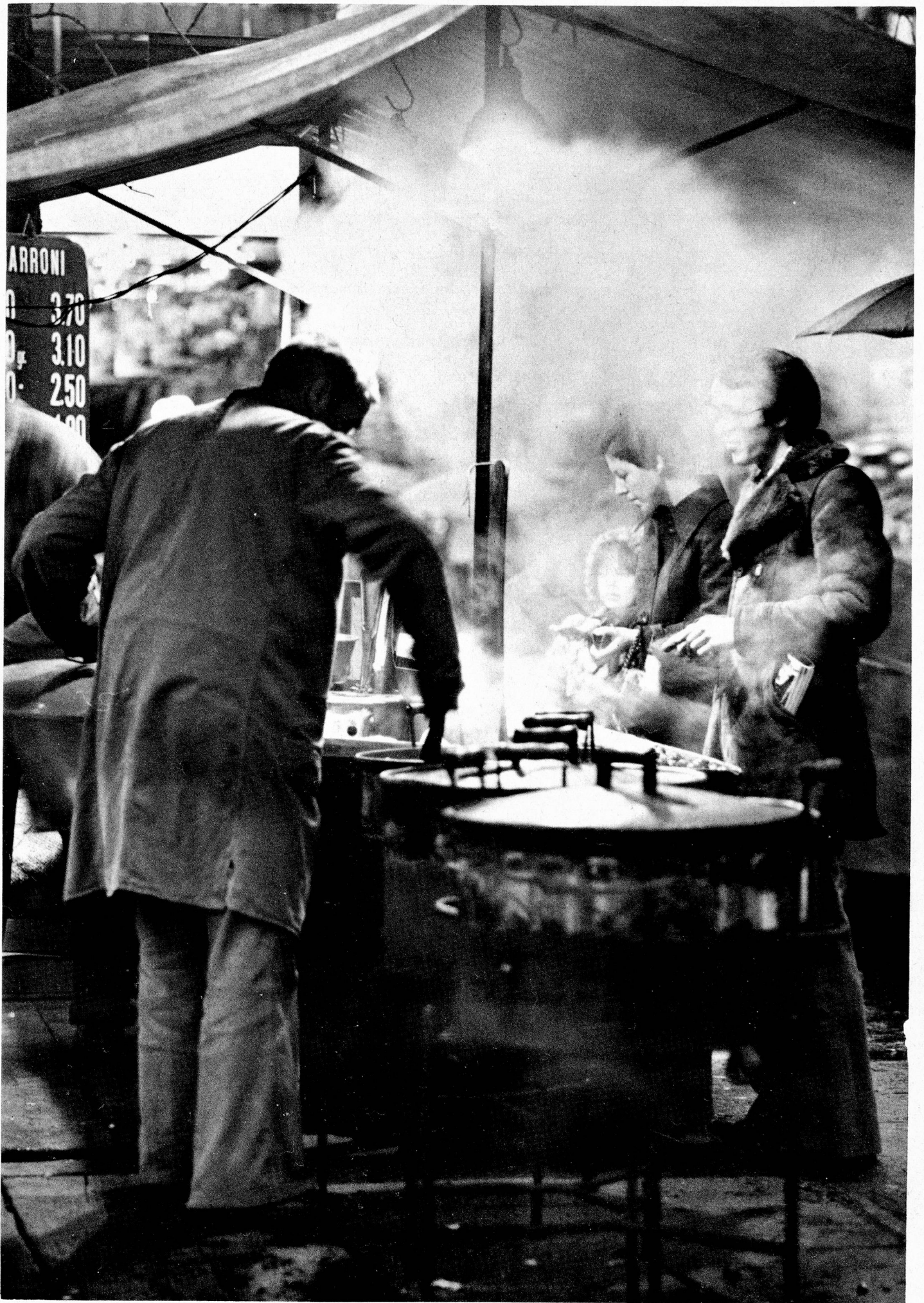
The brightly-lit chestnut stall is part of a Swiss city's Christmas scene. How better to warm one's hands on a wintry night?