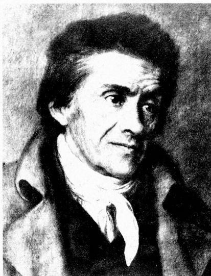
Johann Heinrich Pestalozzi