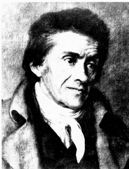
Johann Heinrich Pestalozzi

work of Jean Tinguely of Fribourg technology becomes instead an absurd and ironical game. A human image of the atomic age is incarnated in the heads and figures of Alberto Giacometti. He lived in France, as did also the great architect Le Corbusier, who was born in the Swiss Jura, or the composer Arthur Honegger, who hailed from Zurich. Swiss music of the Classical and Romantic eras was overshadowed by greater European contemporaries. As a new political awareness emerged, the national festival took shape, a popular form of musical theatre. A few names are now known to the outside world; Othmar Schoeck, Arthur Honegger, Frank Martin, Vladimir Vogel, an immigrant who taught the Swiss new ideas. The young composers today move over the broad spectrum of the