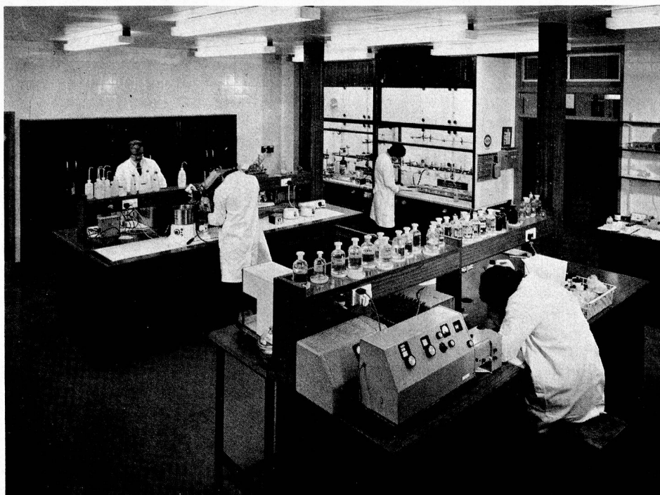
General view of a quality control laboratory in the new laboratory block at Ciba-Geigy Agrochemicals headquarters at Whittlesford, Cambridge.

The representative office will be at 66 Hanover Street, Edinburgh EH2 1HH.