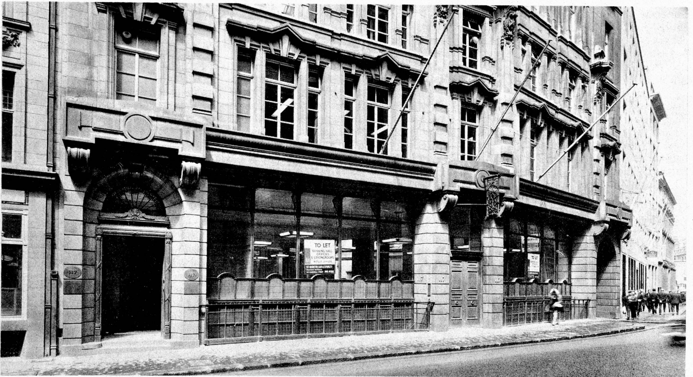
The original Old Broad Street premises.