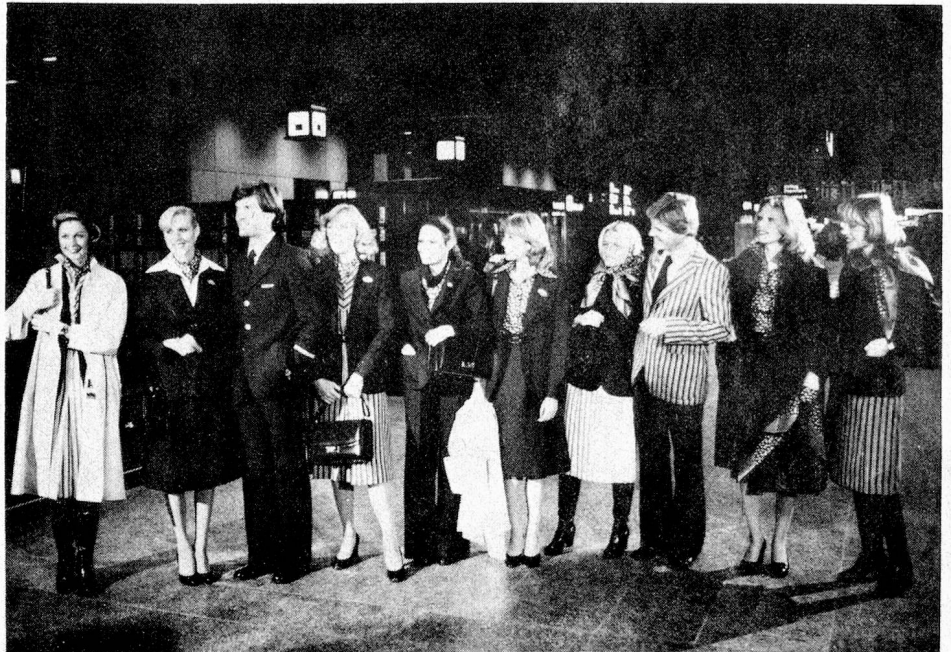
An attractive line-up shows the new Swissair uniforms.

The new ensemble is the result of a two-year trial and selection process. In its final stages seven uniform creations by different designers were tested on regular