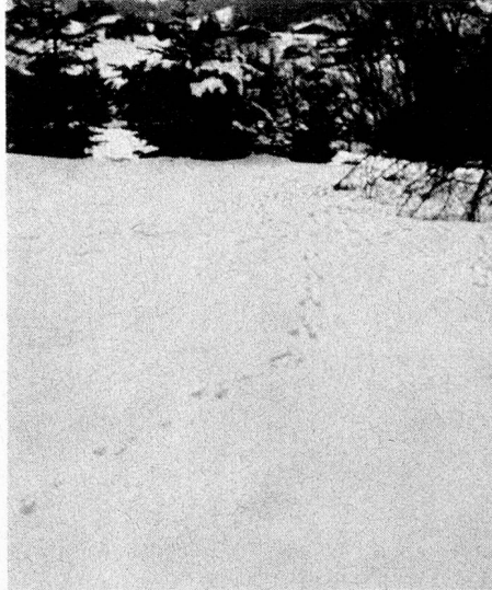
Perhaps Sherlock Holmes could tell us what these are?

But perhaps the most charming sight of all in winter if you are lucky enough to see one is the ermine. This little creature of the weasel family will suddenly appear in the snow, standing bolt upright on two feet and then leap as far as 50-70 cm. (with two feet together) leaving only the lightest track. Equally suddenly as it has appeared it will dart back into the snow and disappear. In summer its fur is brown but in winter it becomes white with only a black tip at the end of the tail.