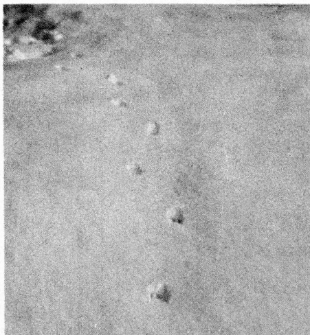
The tracks of a domestic cat.