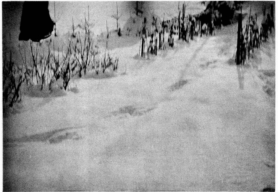
Not easily mistaken — a hare has passed by.