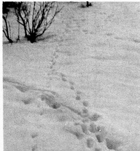
The tracks of a cat and a deer.