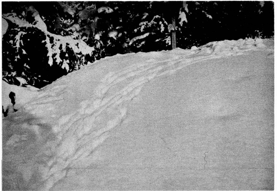
The distinctive tracks of a roe deer.

Foxes and domestic cats walk in a similar way — that is to say almost in a straight line. Other animals do not bring their right and left legs into line, and so the tracks become zigzag. The cat retracts its claws when it walks and so no mark remains.